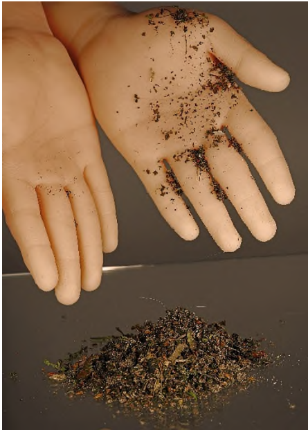
Fig. 2 Vacuum ultraviolet (VUV) modification of silicone surfaces is a possible substitute for gas-phase fluorination. The dirt-repelling, wear-resistant functional coating permits a wide range of applications in medical technology, from prostheses with an adjusted feel to dirt-repellent respiratory masks. The treated silicone hand (left) demonstrates how the coating prevents dirt particles from sticking to the surface.