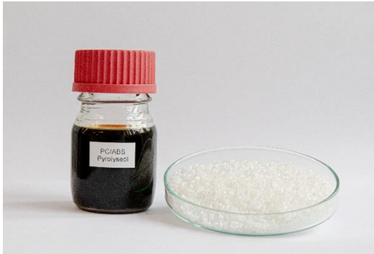
Picture 3 Using the new recycling process, pyrolysis oil is obtained from various types of PC-containing waste as a raw material for the production of plastics.