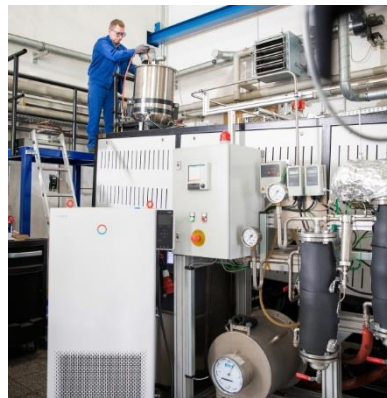
Picture 2 Pyrolysis rotary kilns at the pilot plant scale, with custom-built condensation unit in the foreground