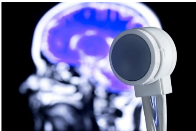
Picture 1: The 3D matrix ultrasound transducer for transcranial neurostimulation can stimulate specific points deep inside the brain with precision targeting.