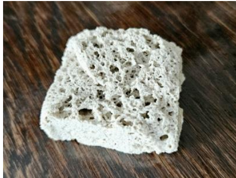
Fig. 3 Mineralized solid "pore stone".