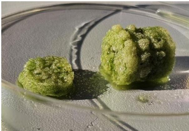
Fig. 2 Living construction material (green = chlorophyll in living bacteria).