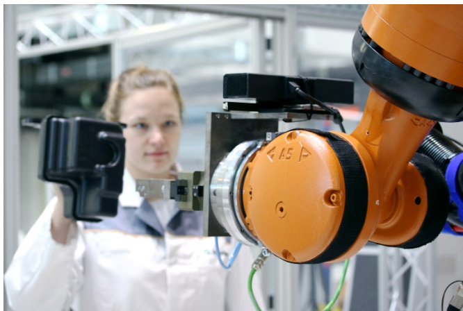
Picture 1: The robot detects the component in the worker's grasp and cautiously follows it until she hands it over.